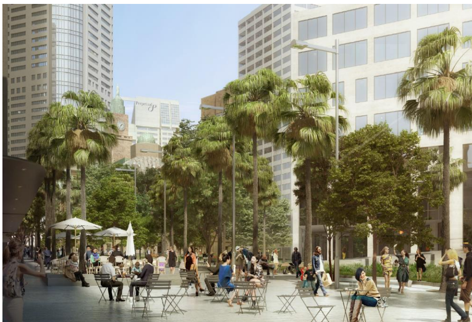
Artist impression - Loftus Street looking south towards Macquarie Place